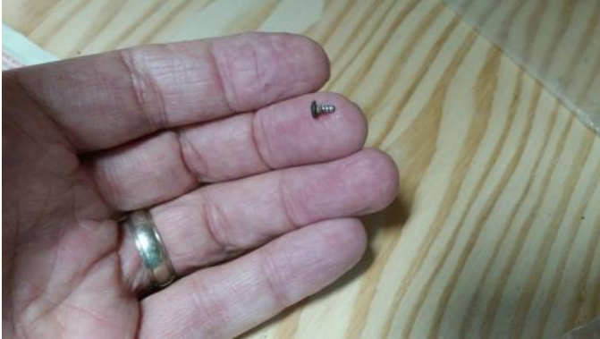
0-5-0 digital clamps, used to hold just about anything except small parts.

Jack: I really appreciate your articles on tools we can use on our modeling projects. You have shown us some interesting ways to, as they say, Ged 'Er Done. I was thinking of how to solve a particular problem I ran into while building my new empire and, after much thought overnight, I came up with some possible solutions that others may appreciate.