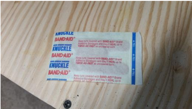
Leaking finger corrector.