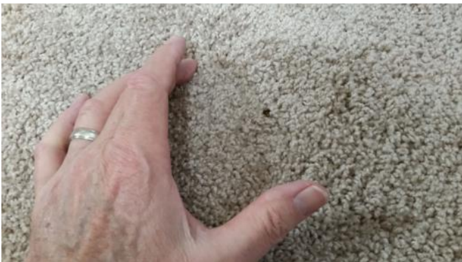
Small parts on the carpet locator.