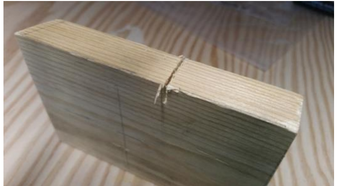
Adjustable measuring gauge.