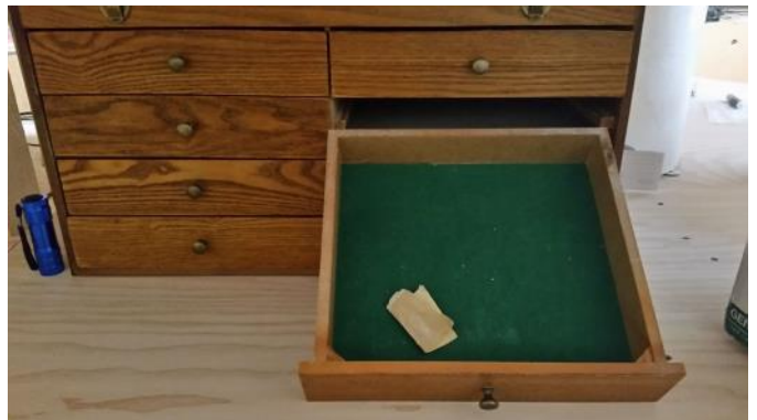
And most important, that place where tools are supposed to be but never are.