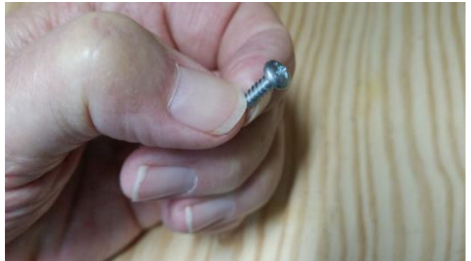
Small parts picker upper.