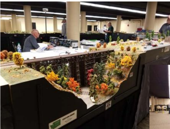
Inland Washington Free-mo layout