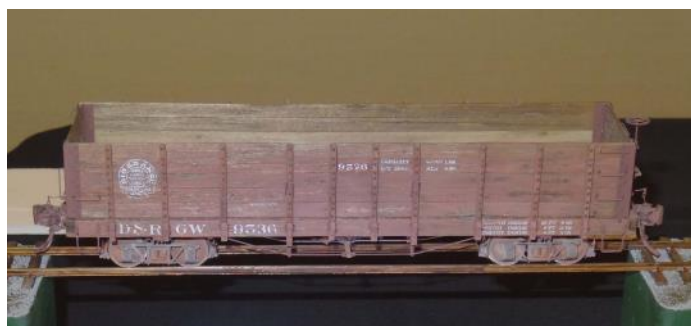
Freight Car - 1st Place—Roger Walker