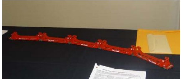
Freight Car - 3rd Place—Robert Deem