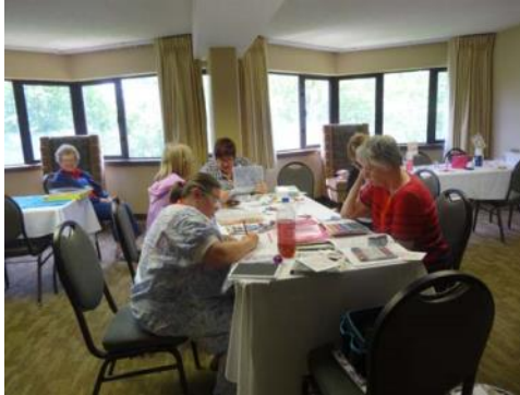
Action in the Non-Rail Room