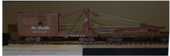
Freight Car - 2nd Place—Roger Walker