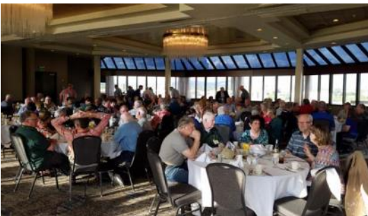
Saturday night banquet crowd