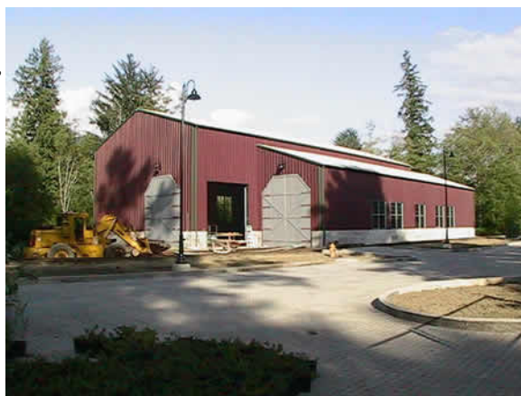
Northwest Railway Museum in Snoqualmie

Non-Railroad Tours and Events are also planned. There are many fine restaurants, entertainment, and shopping in the area. As al-