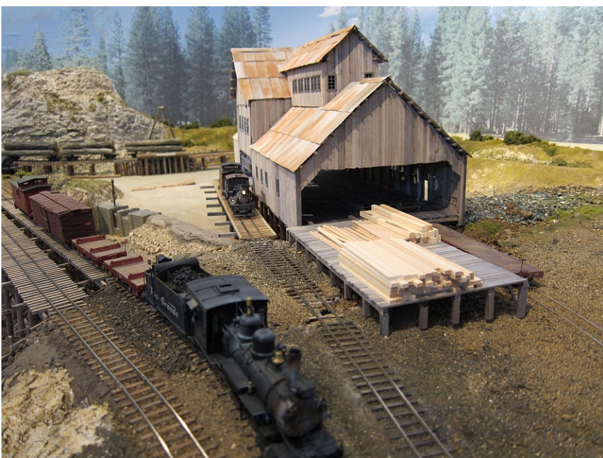
Russ Segner's Sn3 Coal Creek Lumber Company

Prototype Tours will include Seattle's St. Gobain Glass Co.; the Northwest Railway Museum in Snoqualmie, (including a tour of the facilities plus a rail ride); a special rail tour of a local shortline with a 30-mile ride for the first twenty persons to sign up (a once-in-a-lifetime chance!); and a tour of Boeing's Everett Plant.