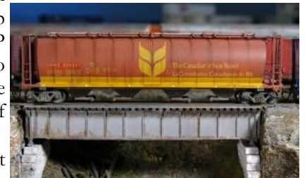
Roger Walker's techniques for realistic weathering of shiny plastic models is one of the featured