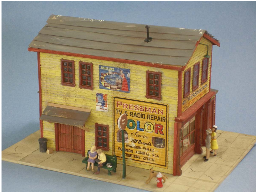
Small clusters of details and items that tell a story add depth to your modeling efforts. The guy sitting next to the girl has completely forgotten about his paper!

Other details including the figures, dog and the fire hydrant are from Woodland Scenics. The sidewalk was included in the kit and painted with the sandstone paint. I built a small extension to the sidewalk near the back door exit and I added some boards, boxes and paper details made from scraps on the workbench. Cracks on the sidewalk were simply drawn onto the sidewalks with a pencil (Thanks to Art Fahie of Bar Mills for this modeling tip.) Pigeon Poop was added to the rooftop with a small brush and some white paint.