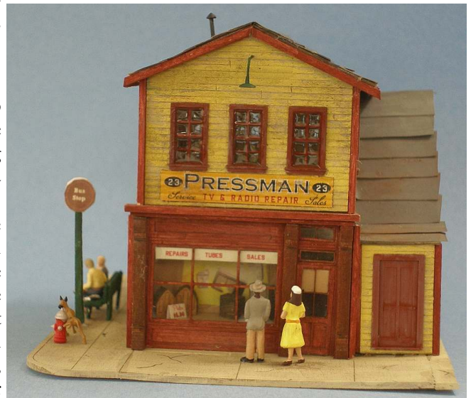
Check out those new fangled TVs in the window.