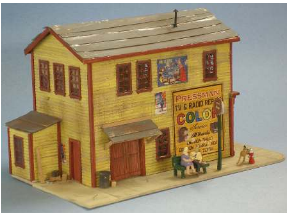
The back door scene was made with small scraps of wood. Add a splash of color and a scrap becomes a detail!