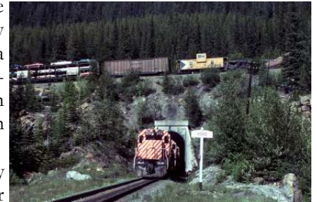
On June 30, 1975, Extra 5714 West was exactly the right length to demonstrate the caboose passing over the locomotives as they exit the lower portal of the Spiral Tunnel. Today's trains are usually more than twice this long.

Another activity scheduled for Northern Lights 2009 is a tour to the Alberta Railway Museum. The ARM collection features equipment from the Northern Alberta Railway and Canadian National Railways, including two steam engines. NAR 73 is a 2-8-0 Consolidation built in 1927 and saw service across Alberta's northern branchlines until 1960. It is the only sur-