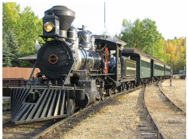
Edmonton Yukon & Pacific 2-6-2 number 107 makes a regular circuit around Fort Edmonton Park. The train, along with the Edmonton Model Railroad Association's freight house and spectacular HO scale layout, are a couple of the many attractions featured at the Northern Lights 2009