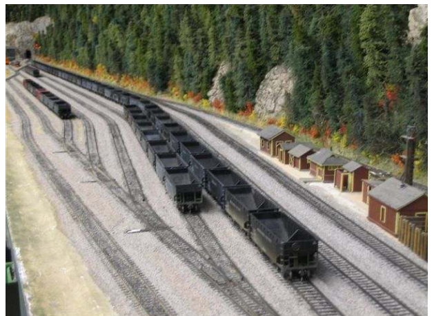
The division point yard at Monashee Summit can handle long trains of hopper cars on the layout of the Edmonton Model Railroad Association. Sign up to operate a train!