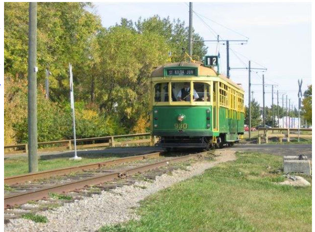
The ERRS streetcar makes a round trip every hour between downtown Edmonton and Old Statbeona taking passengers along beautiful tree-lined