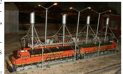
Night time BNSF locomotive servicing in the River City yards.

This 100% NMRA club has about 40 members, and usually has a waiting list. They come from all over the Spokane and Northern Idaho area. Members and spouses include several 5D officers (past and present), several with complete layouts at home too. They