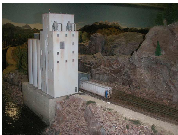
One of the many granaries on this 100% NMRA club layout.