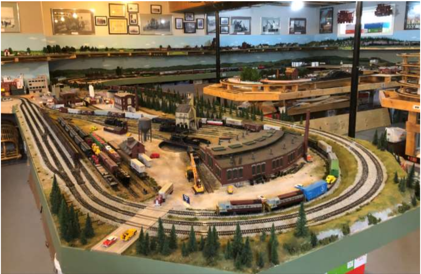
Ian McIntosh has built a large partially double deck layout depicting CP in the transition era. Ian comes from a multi-generation CPR family, hence the layout name, "My Heritage Model Railroad."