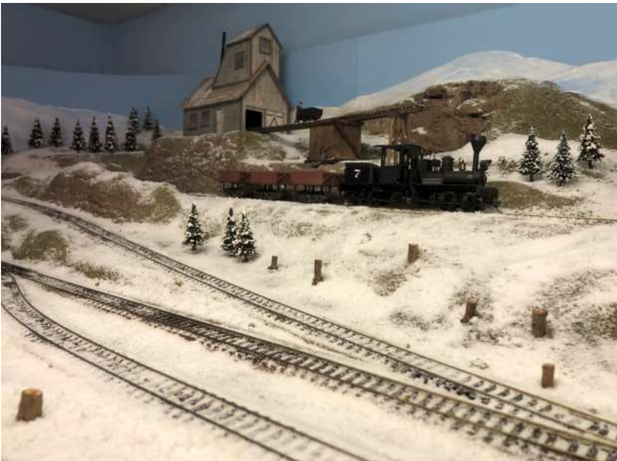
The South Park and Western RR is an On30 layout set in central Colorado, built by Bill Stahl. It is double deck and depicts the railroad serving the mining industry at high elevations where winter comes early. Brrrr!