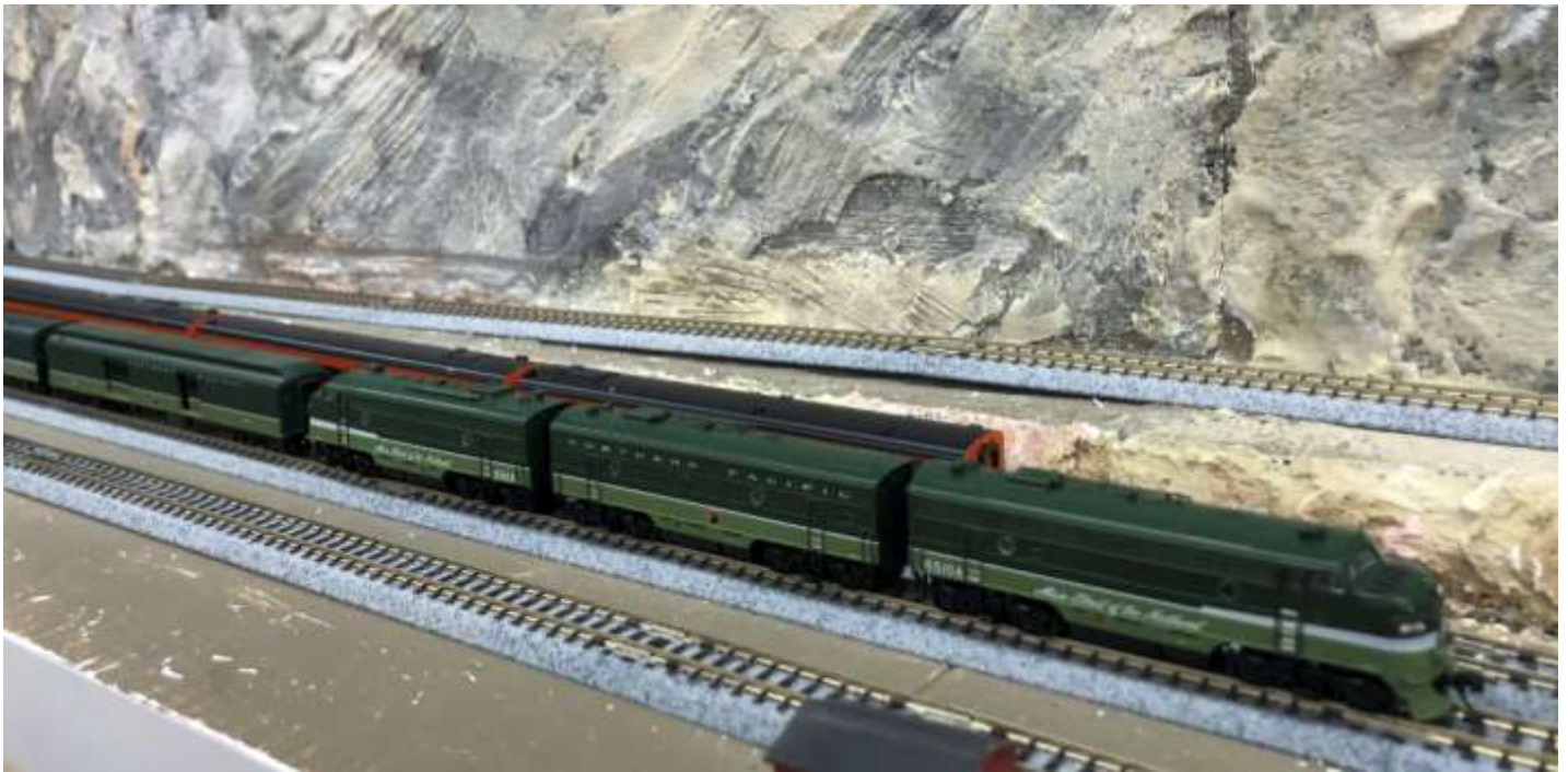
Tyler Smith's Montana & Wyoming is a double deck modular N scale layout set in the period 1947 – 1955. Classic streamliners like Northern Pacific's North Coast Limited and Milwaukee Road's Olympian Hiawatha roam the rails.