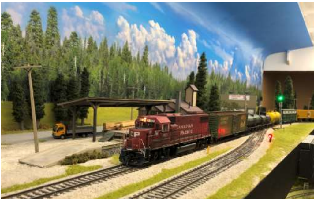
This photo of Rupert James' layout shows the very effective way he has covered his backdrop up to the ceiling, as well as the beautiful photo mural of trees and dramatic cloud formations. The deck here is actually very narrow.