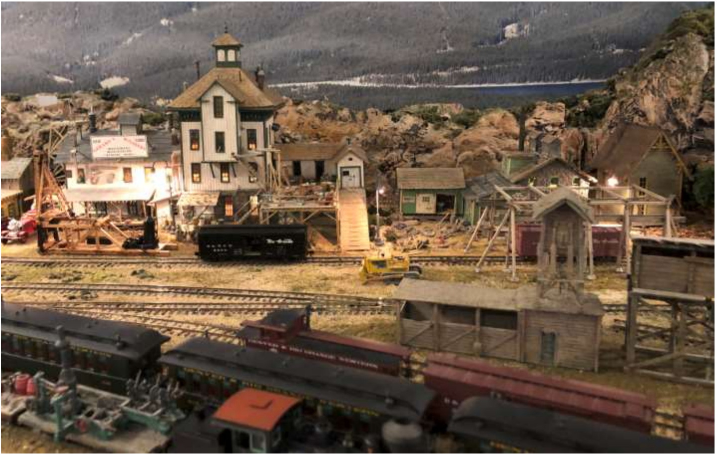
The Coyote Pines Lumber and Navigation Company is an HO scale layout built by Sim Nation, and is highly detailed with dozens of craftsman kit and scratchbuilt structures, rock castings, lighting, and a photo mural backdrop.