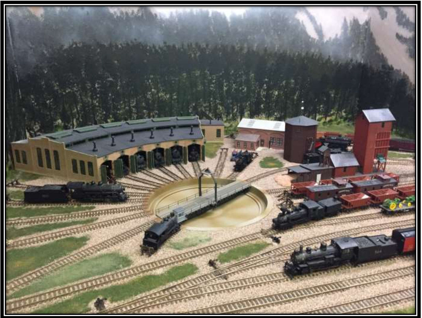
The roundhouse and turntable at Field BC is a focal point on Randy Kvill's layout, set in 1920. Randy's layout was one of six on the layout tour at the Rose City Meet in Camrose on the May Long Weekend. More photos of the Meet's activities are in this issue.