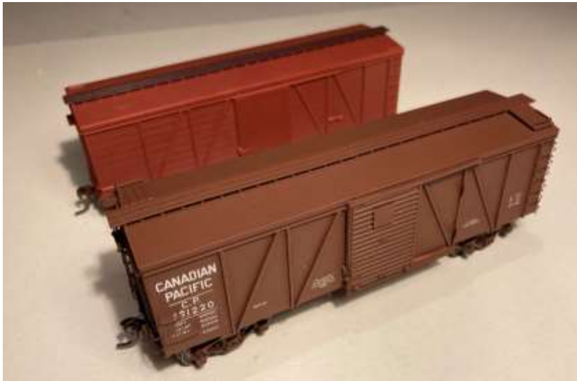
Place the car on your layout and enjoy!

The last detail is to add the stirrup steps. Plastic steps are included in the kit. Glue these to the underside in each corner and paint to match the car body colour.