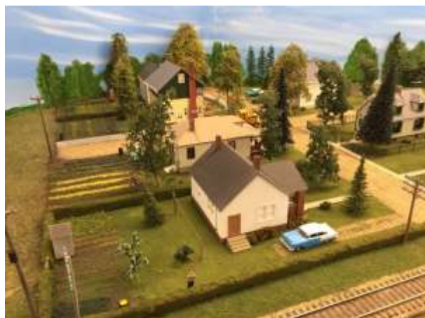
A couple of town scenes on Doug Burton's CN Prairie highly detailed layout