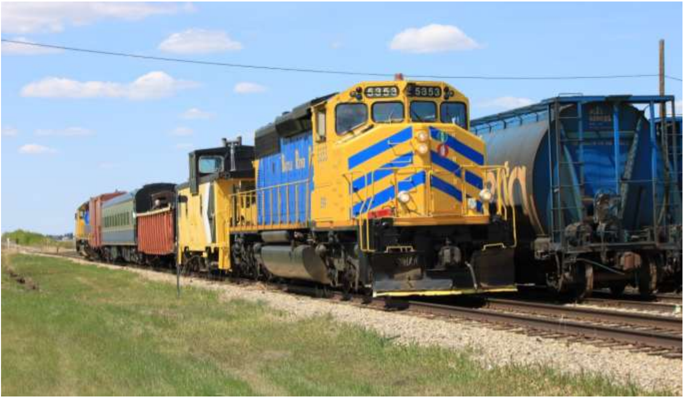
A former CN SD40-2 led the eastbound train to Rosalind where we boarded the gondola.