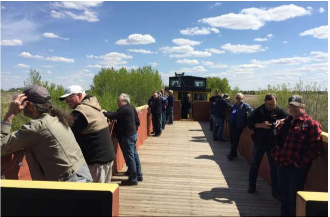
The open gondola was a perfect place to enjoy the ride on a sunny afternoon, although the caboose cupola was nice too.