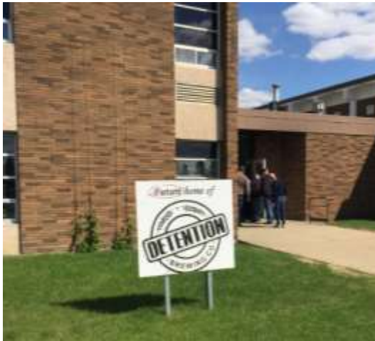
Rosalind School and some of the detailed scenes depicted on Battle River Railway Modellers Free-mo modules.

We returned to Rosalind a little over an hour later and made our way over to the repurposed school, now home to the Detention Brewing Company which occupies the gymnasium and a couple of classrooms on the main floor. Upstairs, the Battle River Railway Modellers club have filled another classroom with their Free-mo module layout.