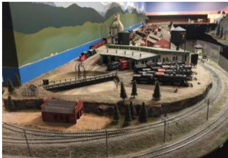
The Alberta Pacific is set in 1958, with steam power still in use.