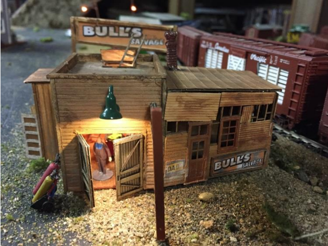
Bull's salvage, a Bar Mills kit.