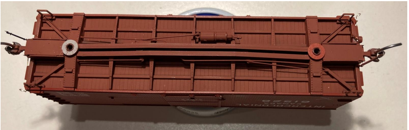
Photo 5 above shows the underbody painted with Floquil box car red, a good match to the car body. The floor is now position into the car body, making sure that my additions don't interfere with the sides or ends. I also painted the trucks the same colour as the under floor. Photo 6 shows the painted trucks, with the truck tuner tool in one of the trucks. This tool cleans out and reshapes the cone in the truck side frames. I then installed Intermountain 33' wheel sets. This combination gives a good free rolling ride for my cars and is now my standard for the railroad.