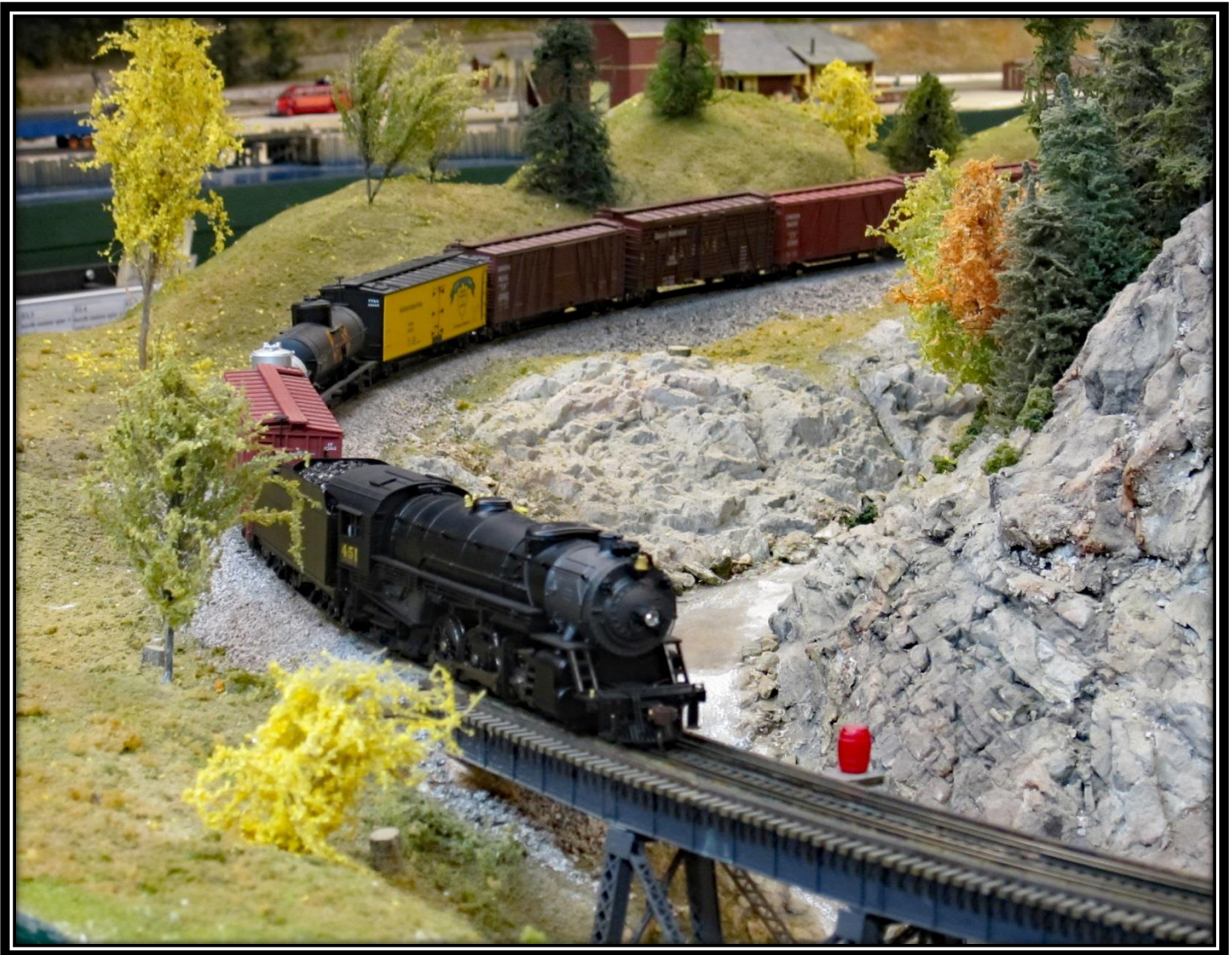
A scene on the Edmonton Model Railroad Association's Monashee Pacific Railway. The club is celebrating its 75 th Anniversary this year as well as completing a major building expansion.