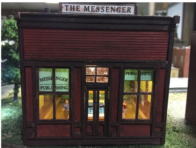
The Messenger building is an old Timberline kit he had for some time from.