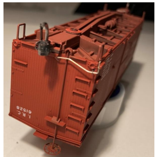
Photo 7 shows the brake wheel and brake rod installed on the car end. In this case, I just went with the detail in the kit. I did add a coupler cut lever (Detail Associates part #6215). You could add a clevis and chain to the bottom of the brake rod. You could also add the brake valve and rod to the left of of the brake wheel/rod assembly. The wheel and rod were also painted Floquil box car red.