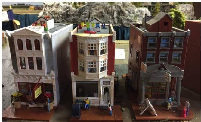
He also built a set of "Homes of Yesterday" kits.