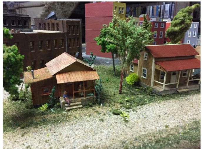
These three small kits are Suydam models.