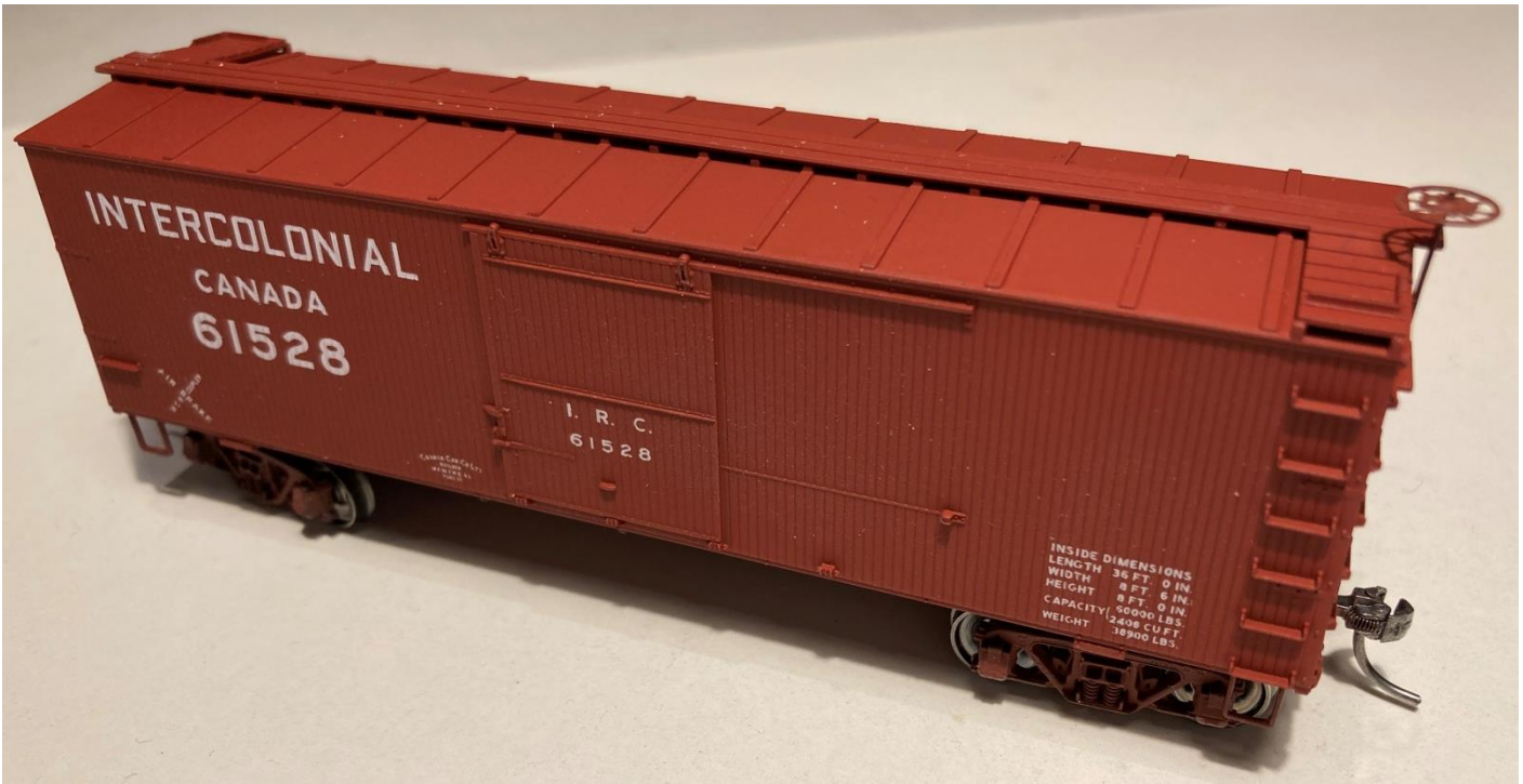
Photo 8 shows the car now assembled. I have added and painted the sill steps, found on either side, at the ends of the car. This is as far as I am taking the project. However, there is a lot more that can be done with these kits. They are good kit bashing/detailing projects!