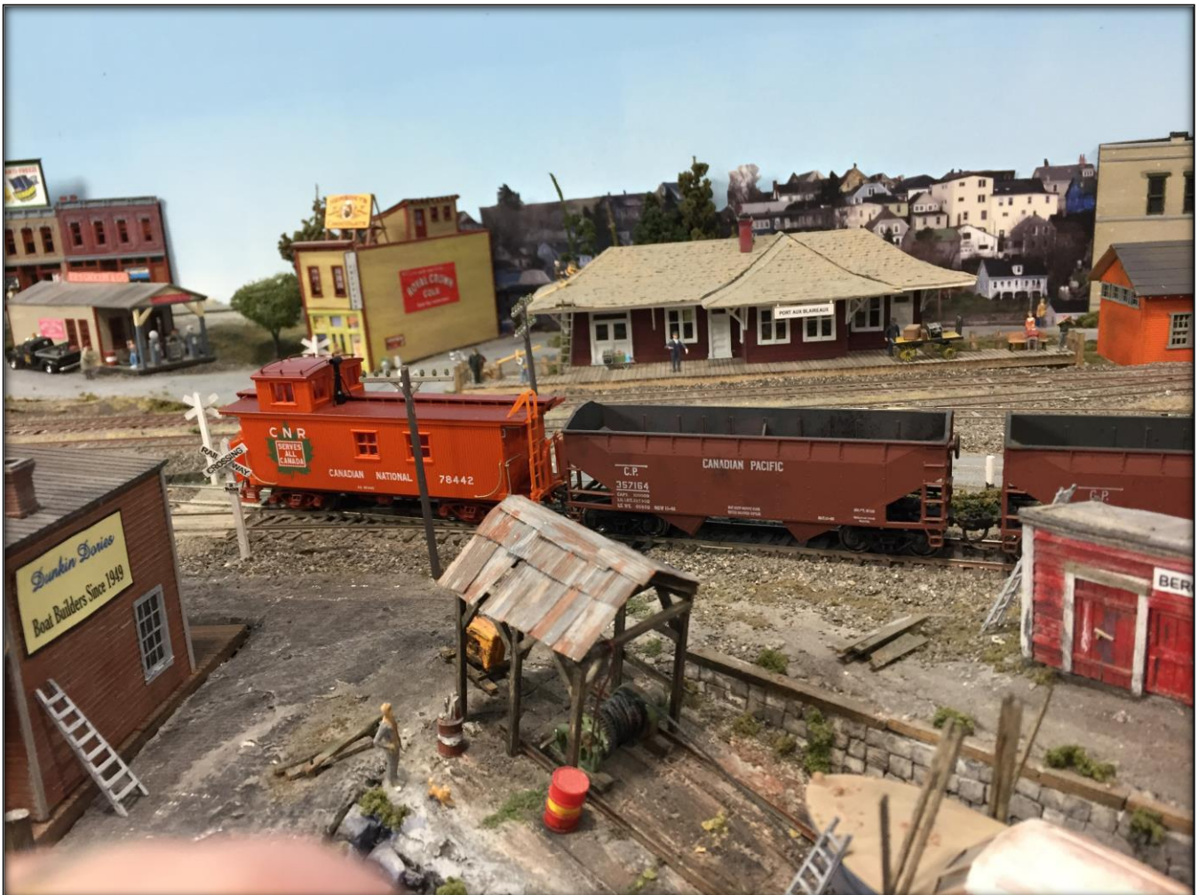
A CN freight train makes its way past the Port Aux Blaireaux station on Joe Sheppard's well-detailed Tamarack Northern Railway layout. This was one of the many fine layouts open for visitors during the Calgary Model Railway Society's recent Layout Tour weekend.