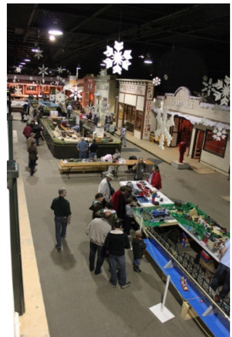
Pictures clockwise from top: Saskatchewan Lego Users Group, Prairie Rail Workshop, Main Street overview, Regina G Railers