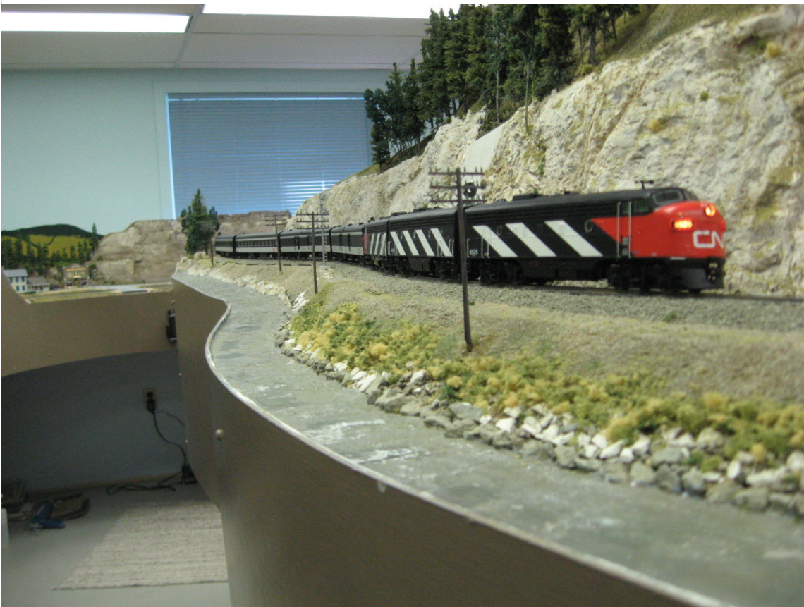
CN No 2 running along the North Thompson on Norm Skretting's Clearwater sub